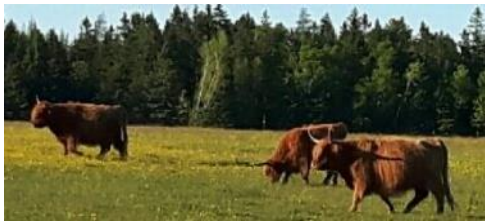
Lansdowne Road Cows