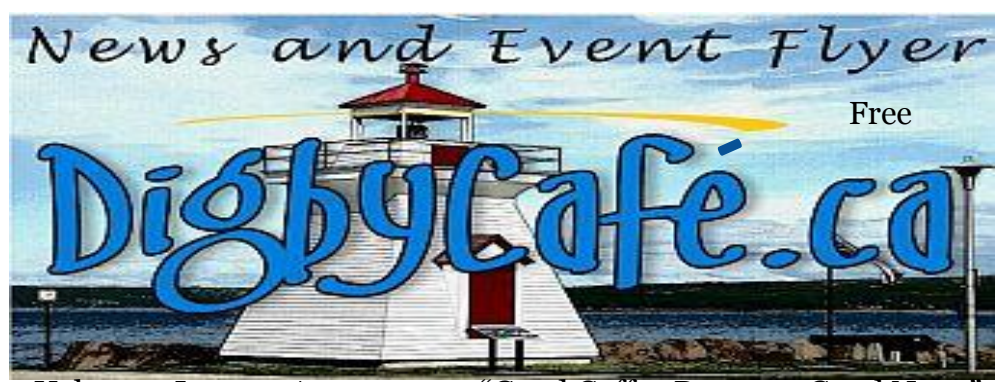
Volume 1 Issue 2 August 2017 "Good Coffee Deserves Good News"

Coffee Bar and Gallery Bear River 902 467 0128 1886 Clementsvale Rd. Annapolis Royal 902 286 3010 www.sissiboocoffee.com User Card earns free Coffee