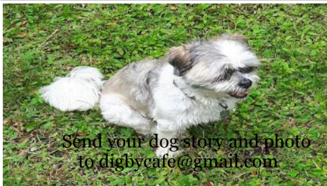
Send your dog story and photo to digbycafe@gmail.com

They asked me if I could take her for a walk while they were gone. This was a real treat for me and she was raring to go. Up the Chute road we went, with her choking and gasping on the end of the leash. She was in such a hurry. It wasn't long till I found out why. At the side of the road she laid down three perfect doolies for me to pick up. I felt so proud that I had done such a good job walking the dog. It could have been my dog the people saw as the cars whooshed by and the cyclists panted up the hill, all envious of such a smart little dog. My dog for the day...Lilly from Away.